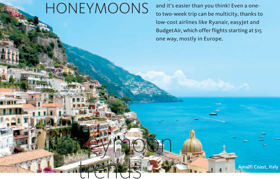
Amalfi Coast, Italy

Packing multiple destinations into your honeymoon is now a mainstream concept, and it's easier than you think! Even a one-to two-week trip can be multicity, thanks to low-cost airlines like Ryanair, easyJet and BudgetAir, which offer flights starting at $15 one way, mostly in Europe.